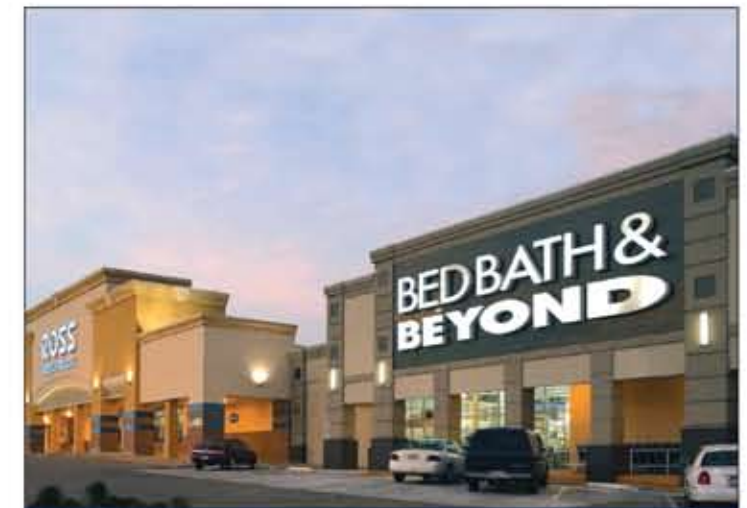
Bryant Square, Edmond, OK