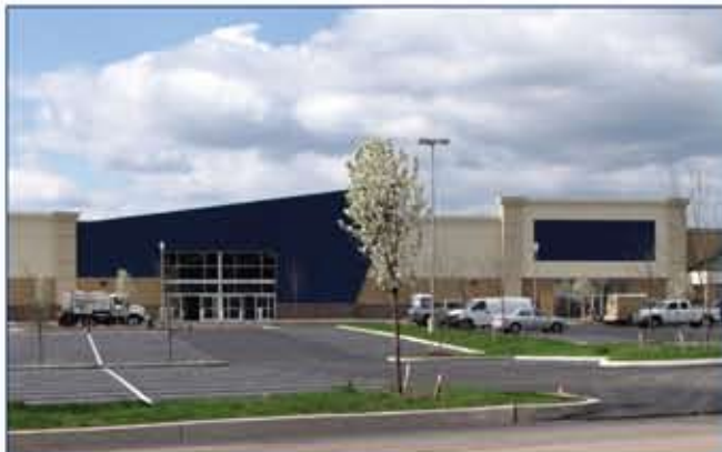
Upland Square, Pottstown, PA 655,000 SF Under Construction • Opening July 2009

Our property management portfolio has grown to include a diverse mix of over 80 properties throughout Pennsylvania, New Jersey, Delaware, Maryland and New York. Assignments range from small unanchored strip centers and supermarket-anchored community centers to regional power centers and malls.